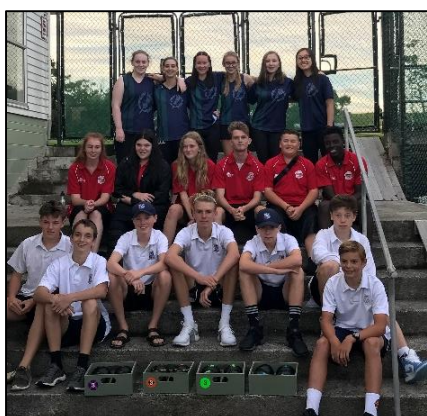
Glendowie College, Sacred Heart and Selwyn College participants