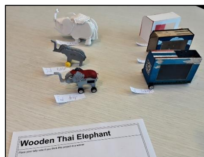
2 nd Runner Up – The Thai Elephant