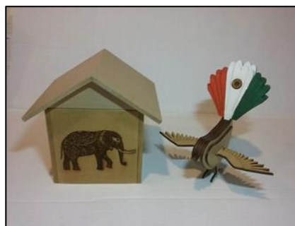
The Indian Fantail group's winning product