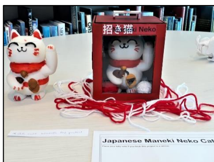
1 st Runner Up – The Japanese Maneki Neko Cat