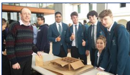
'Crafted Candles' selling their homemade candles