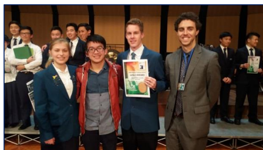
Proud Gold Award Winners.