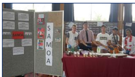
'TANE' bringing a taste from the Islands