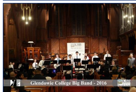
Top to bottom: Glendowie College's Wind Band, Concert Band and Big Band.