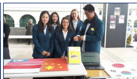
'Yang Fruity Family' taking orders for their 'Culturestatic' workbooks aimed towards 6-7 year olds; exposing the young minds to Japanese, Malaysian, Chinese, Korean and Indonesian cultures