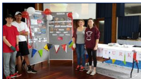
'Ataturk' giving an experience of Turkish culture

As part of the Year 11 Business Studies course, 6 student based companies spent time in-class as well as out of class, planning and organising their business venture with a focus on 'cultural awareness'.