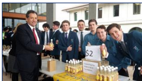
'Blackshack' selling their homemade lemonade