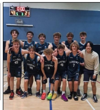
U17 Boys Basketball Central Eastern B Grade