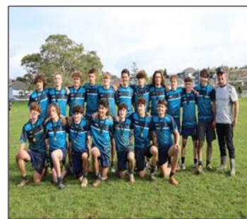
1R Boys Rugby B Grade

Congratulations to these boys on their achievement. Along with our 6th-grade Rugby team, they are showing that Glendowie can compete as a top Rugby school.