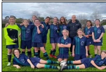
Junior Girls Football Central B Grade