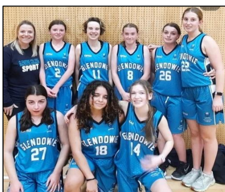
Open Girls Basketball Central Eastern B Grade