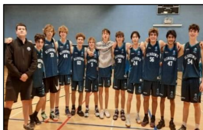
U17 Boys Basketball Central Eastern A Grade